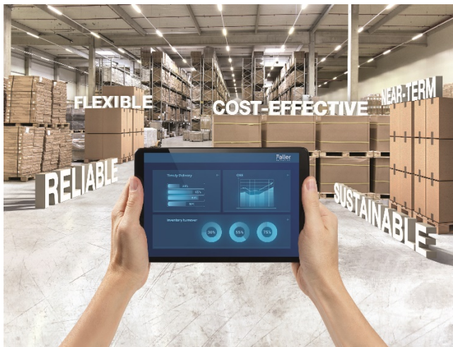
Image 1: Digital supply chain solutions help make pharmaceutical packaging procurement faster, more cost-efficient and more sustainable.