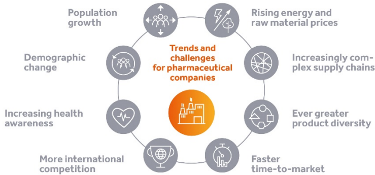
Image 2: Complexity along the entire value chain is increasing together with the challenges in the pharmaceutical and healthcare industries.